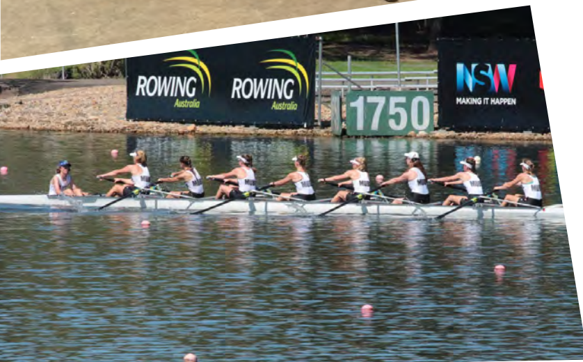
The club womens 8+ taking out the bronze!